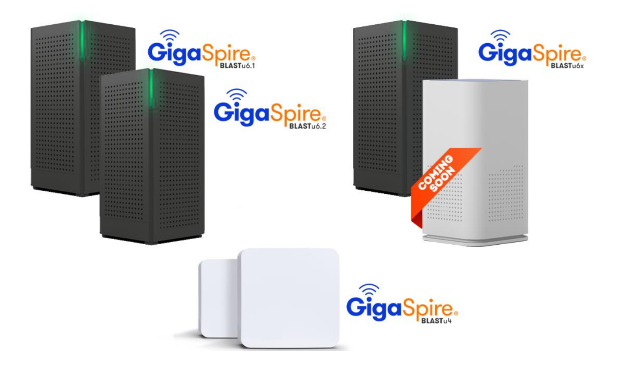
Figure 1: Calix offers a portfolio of GigaSpire BLAST systems, giving you the flexibility to offer the ideal system, based on your subscribers' unique requirements.

It is this diversity that inspired Calix to expand our portfolio of EDGE Systems; the GigaSpire BLAST portfolio (Figure 1).